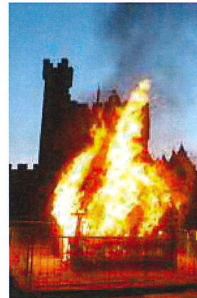
Bonfire Beacon, Killyleagh, County Down, Northern Ireland.