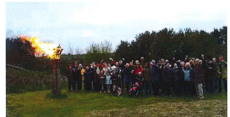
Beacon at Manor Farm, Strete, Devon